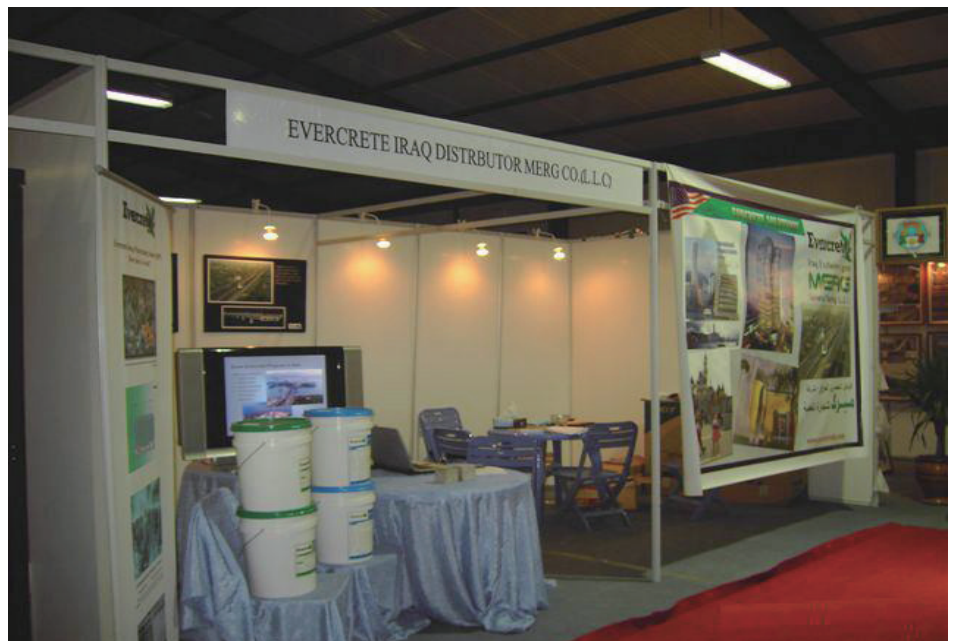
Iraq - Merg's booth in "Erbil Trade Fair"

January, 2007 - From 20 to 26 January 2007 Evercrete's Iraq distributor Iraq - Merg joined "Erbil Trade Fair", the largest annual exhibition in Erbil, Kurdistan, Iraq.